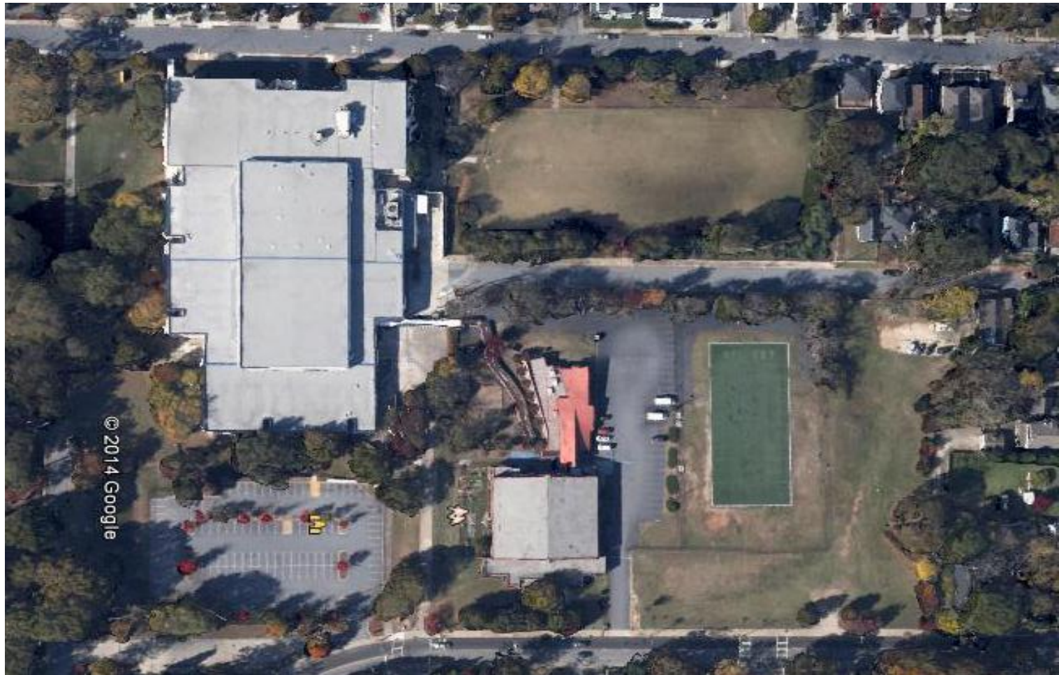
Aerial View of Existing Site