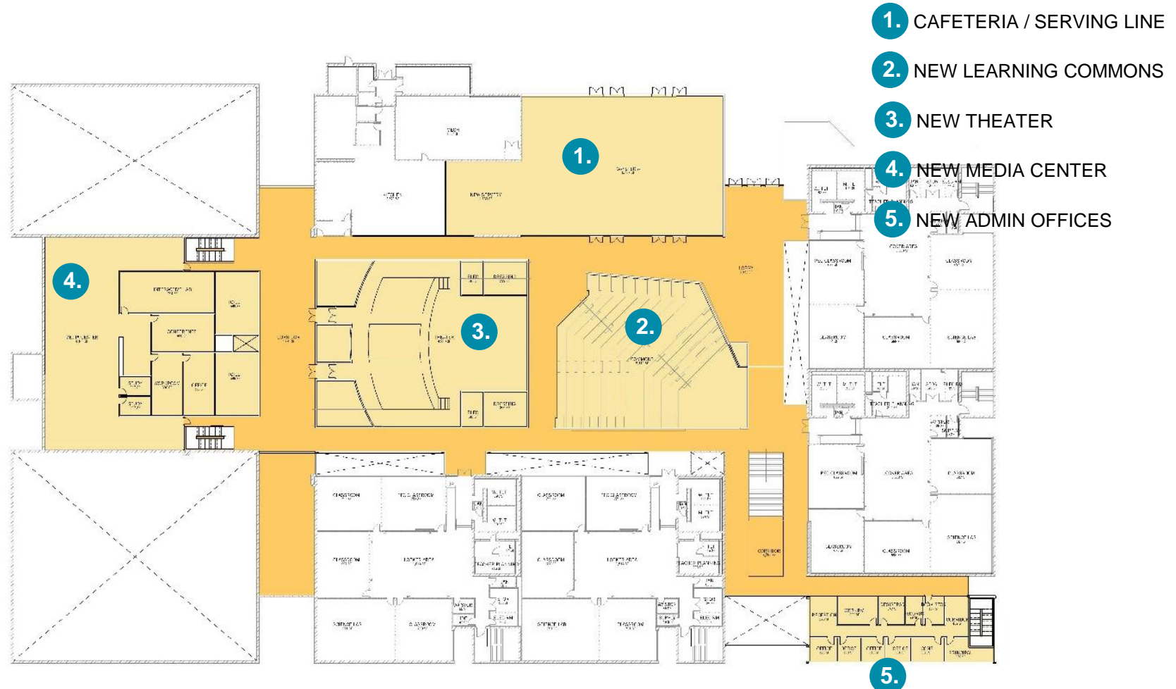
Proposed Second Floor Plan