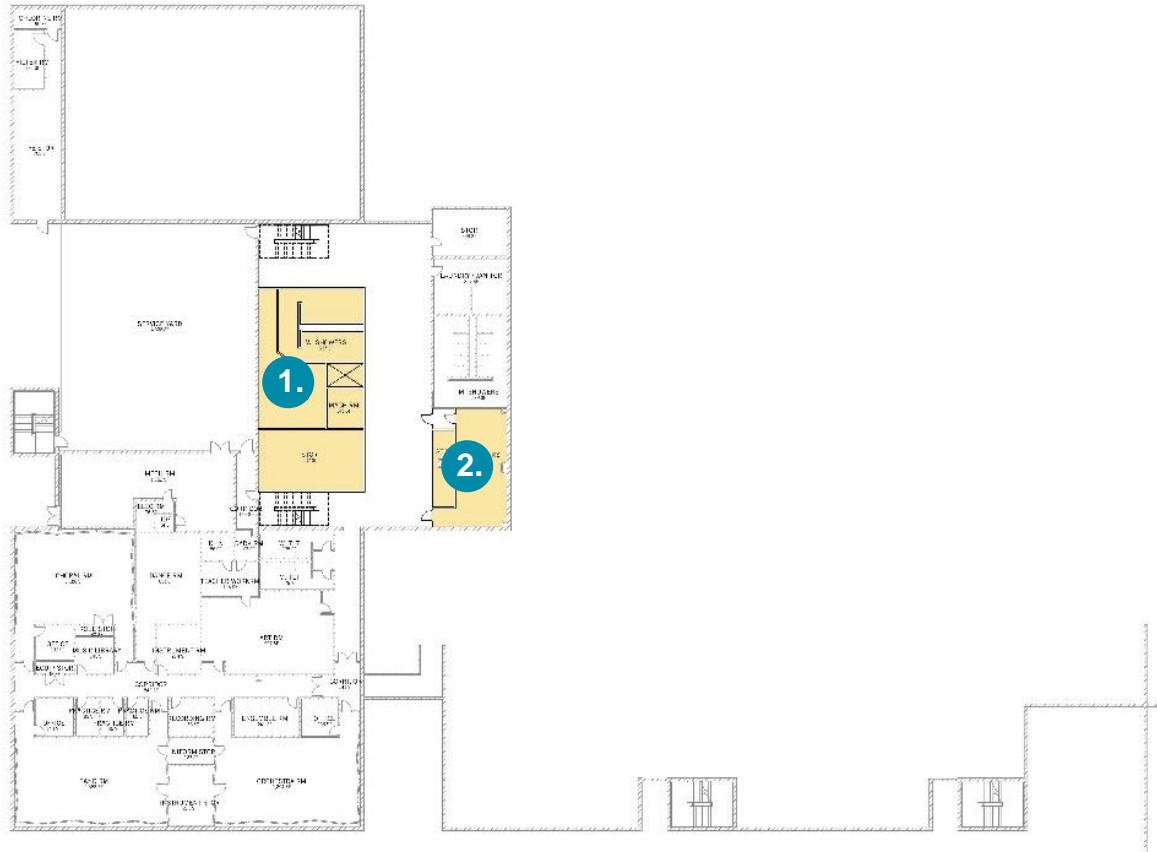
Proposed Basement Floor Plan