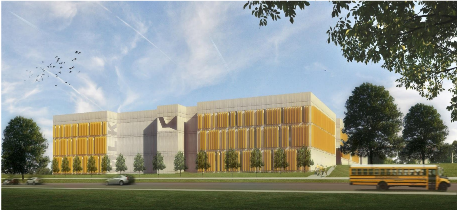
Proposed View of West Facade