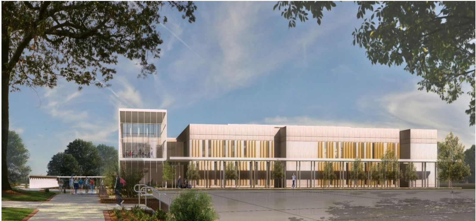
Proposed View of East Facade