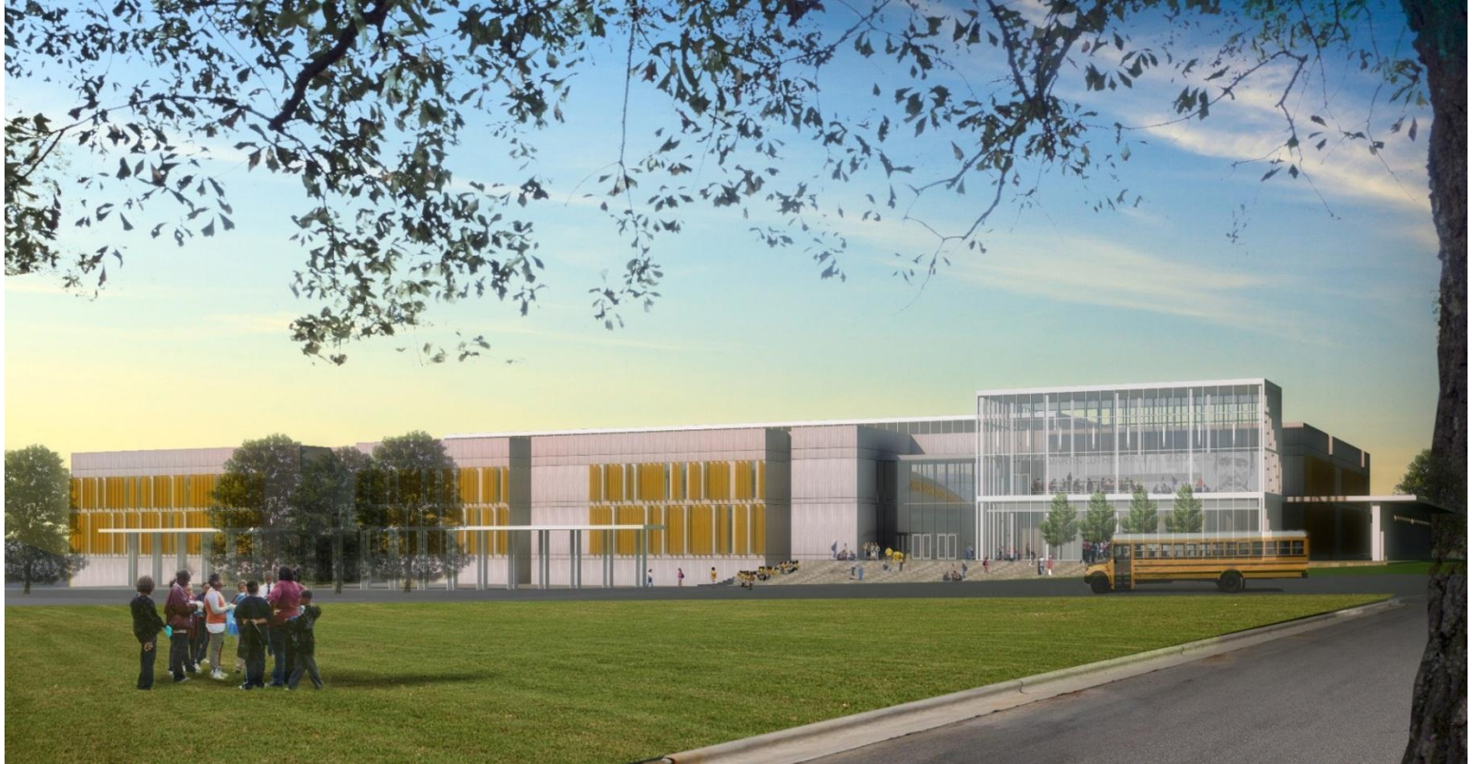
Proposed View of South Facade