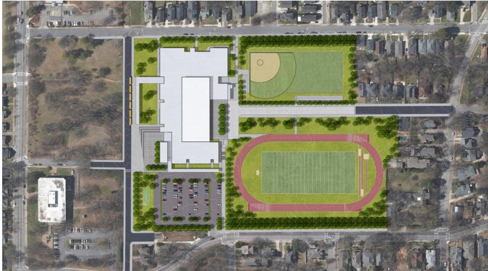
Proposed New Site Plan