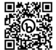
My School Bucks

My School Bucks is an APS-managed app that allows parents to pre-pay for student meals by adding money to student accounts. To set up this app, you will need to enter your child's Student ID number and it will auto-populate with the MES information. Students use an assigned 5-digit lunch number to "charge" meals to their pre-paid account.