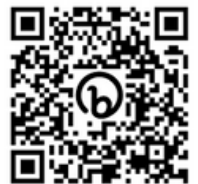
Here Comes the Bus

Here Comes the Bus is an APS-managed app that allows parents to track where their assigned school bus is on its daily route. To set up this app, you will need to enter the school code "87794" and then set up a profile with your child's Student ID number. A parent user guide can be found at the link below.