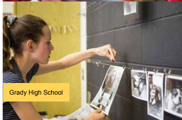
Grady High School