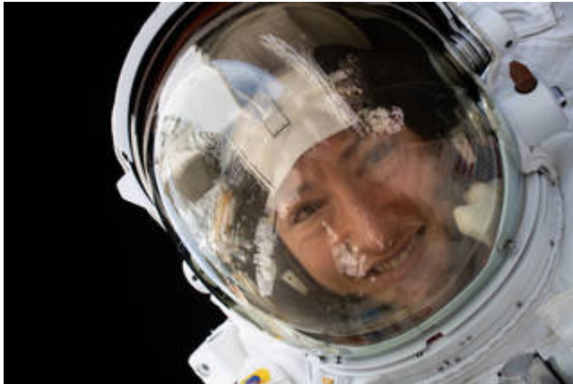
NASA astronaut Christina Koch is pictured during a spacewalk.