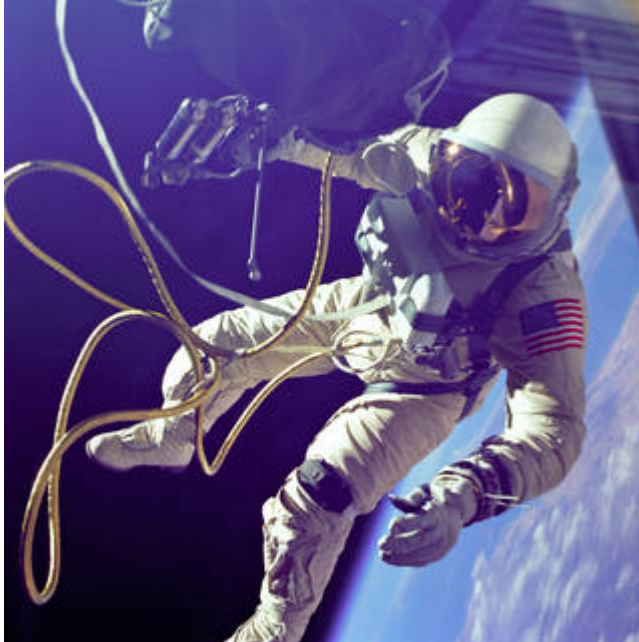
Astronaut Ed White was the first American to walk in space.