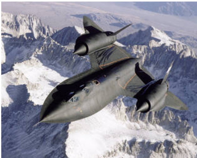
NASA tested two SR-71 aircraft. They are still the world's fastest and highest-flying aircraft.

This article is part of the NASA Knows (Grades K-4) series.