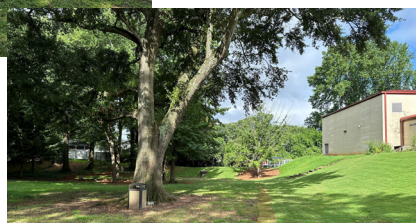
After Summer 2024