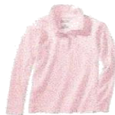
Short or Long Sleeved Pink Polo