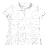
Short or Long Sleeved White Polo