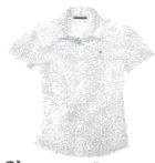
Short or Long Sleeved White Oxford