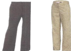
Brown or Khaki Pants