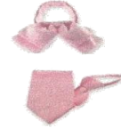
Dress Ties Optional