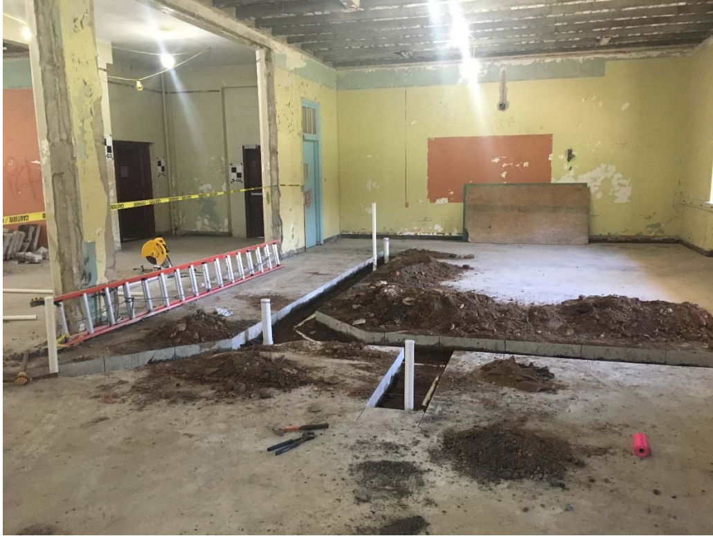
Plumbing trenches being cut on first floor