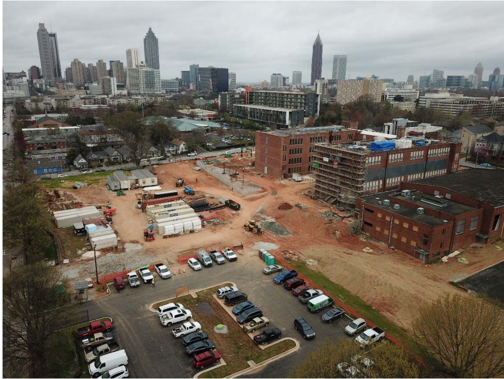
Project overview facing Southeast with Area 1 SOG complete