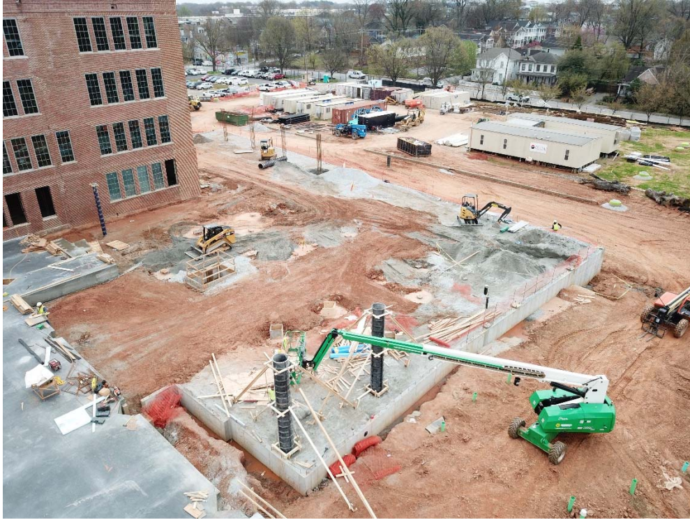
Completed Brick Restoration – Westside of East Wing