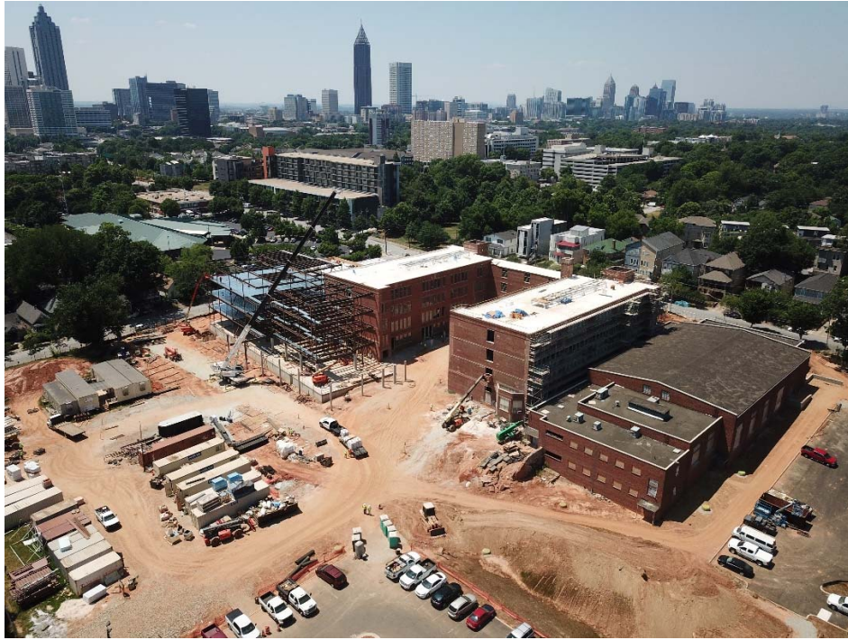
Project Overview looking NW