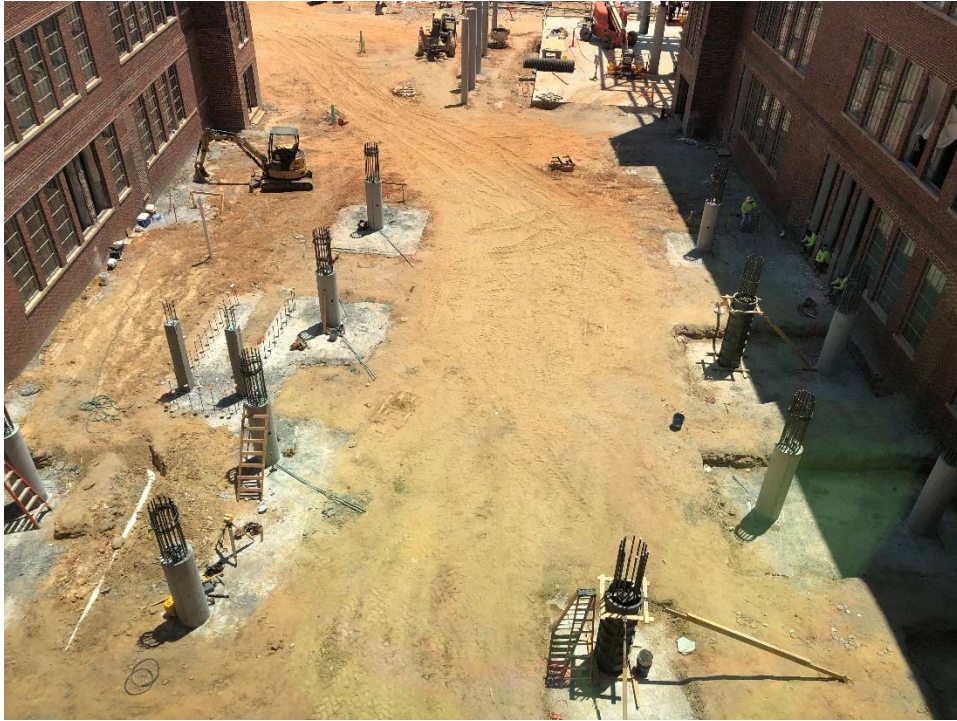
Area 2 Media Center Column & Footings/ UG Plumbing