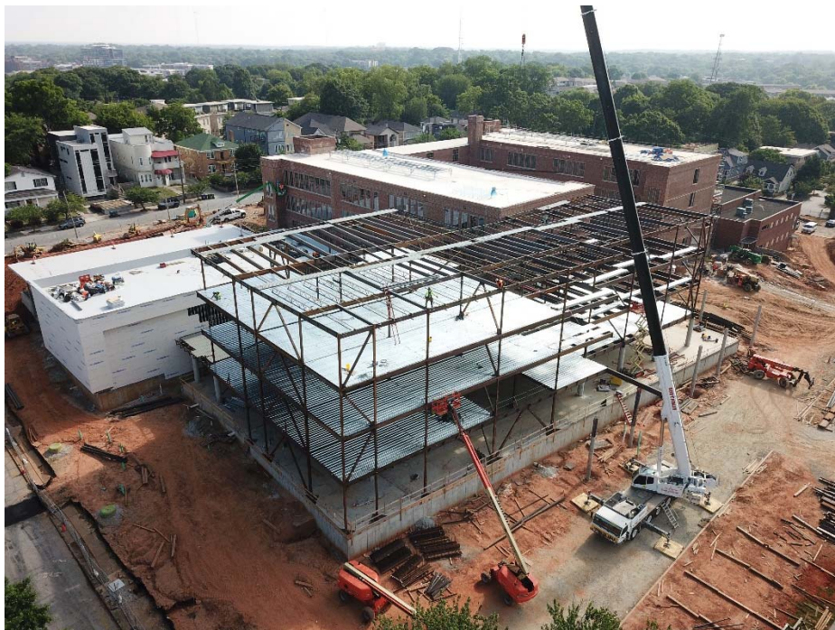
Area 5 Steel Erection Progress