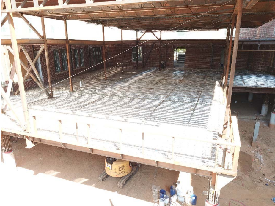
Area 5 brick work