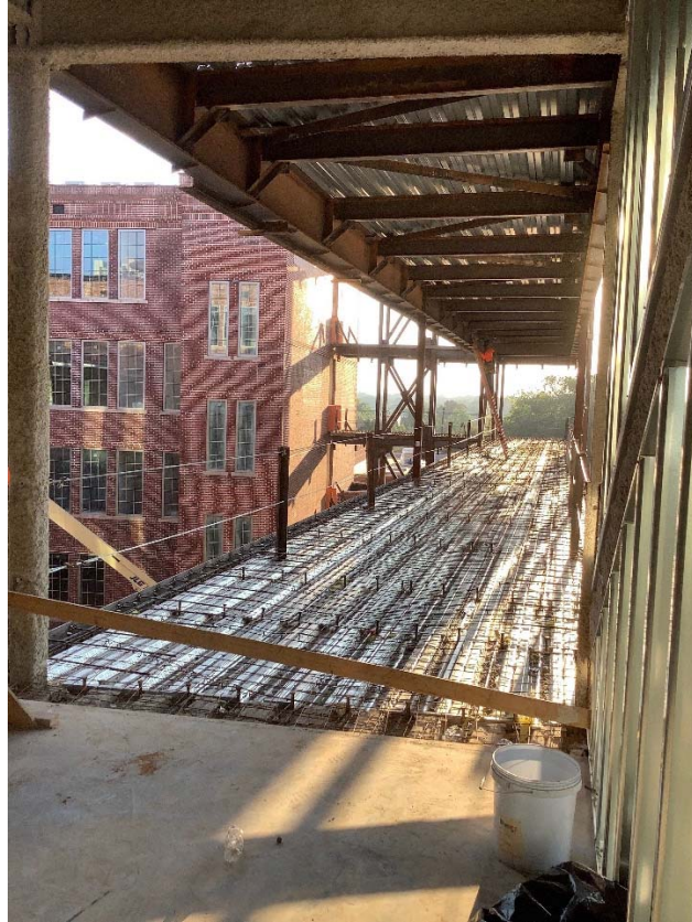
Area 1 Interior Progress