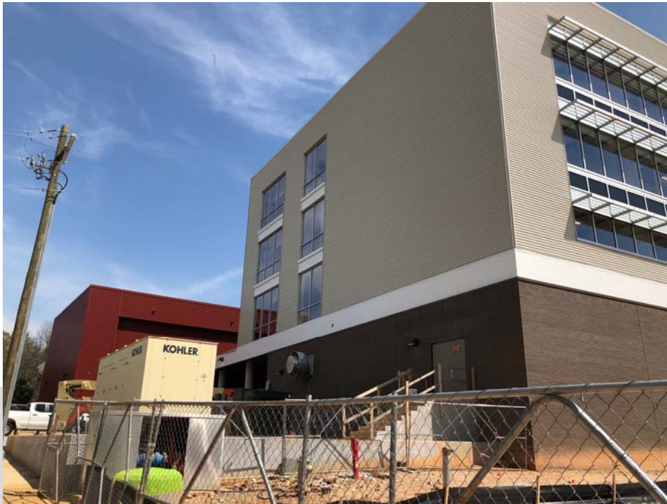
SW corner of Classroom Building