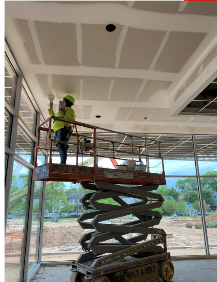
Cafeteria Ceiling – final finishing