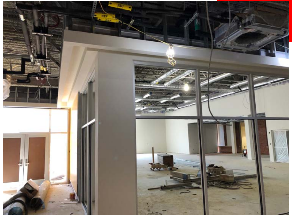
Media Center Entrance Lobby