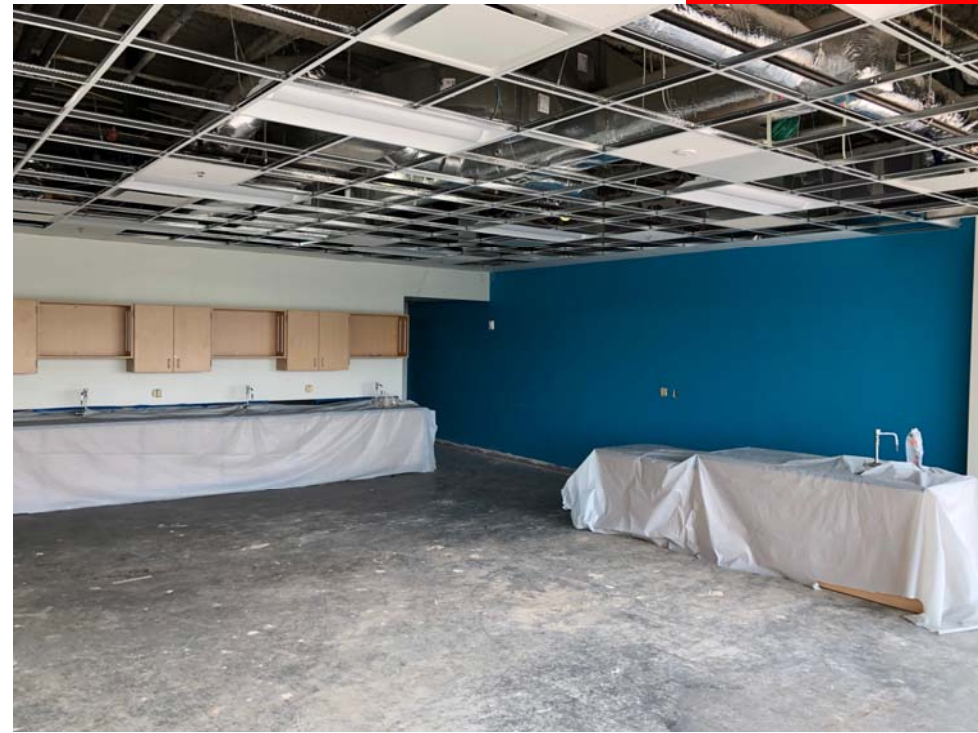
Typical Classroom in Classroom Bldg