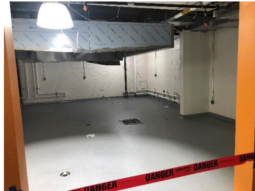
Epoxy Flooring at Cafeteria Kitchen