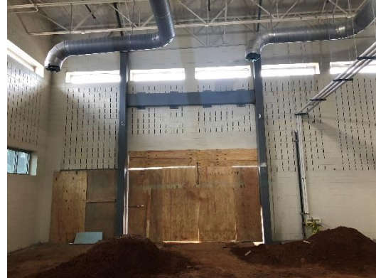
Structural Steel Installed at Aviation Openings