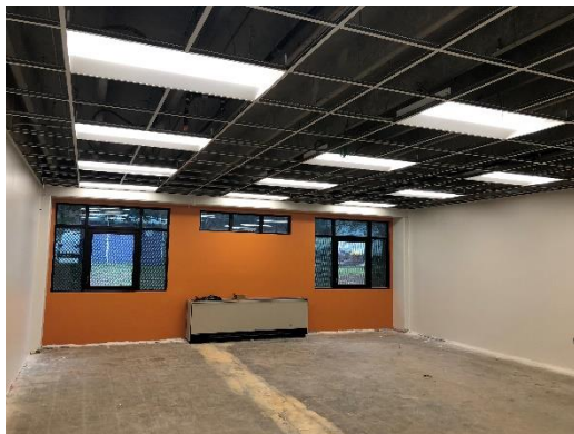
Second Floor Classroom New Light Fixtures