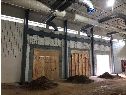
Structural Steel Installed at Auto Lab Openings