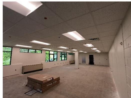
Ceiling Tile Installed at I.T. Lab 222