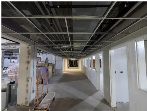
Ceiling Grid Installed at Corridor 157