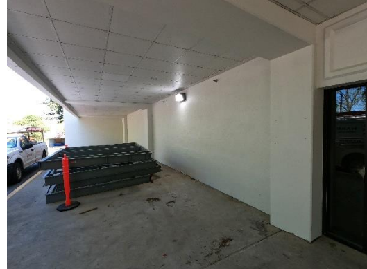
Exterior Paint at Front of Main Building