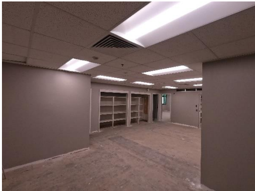
Ceiling Tile Installed at Reception Area 202