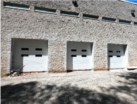
Automotive Lab Sectional Doors Installed