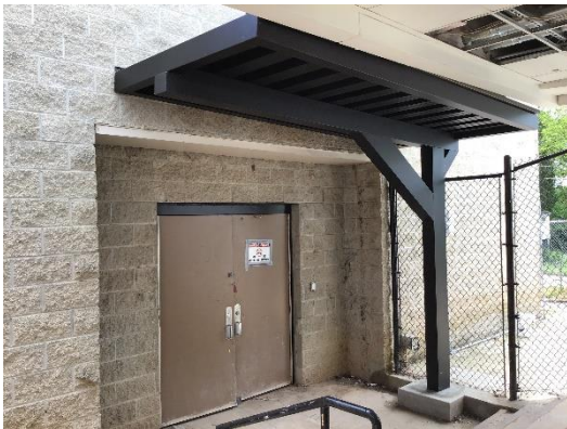
Metal Canopy Installed