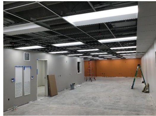
Light Fixtures Installed at Nursing Lab 129