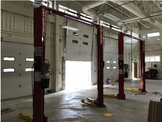
Car Lifts Installed at Automotive Lab