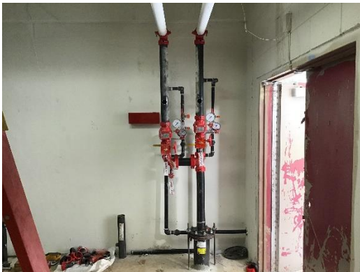
New Fire Riser at Building Storage Room 135