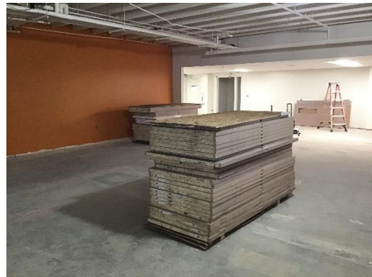
Wood Doors on Site