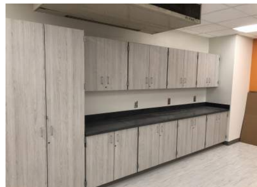
Installation of Casework and Countertops in the Nursing Lab 129