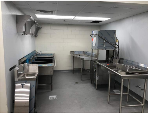
Installation of Kitchen Equipment in the Culinary Arts Lab 136