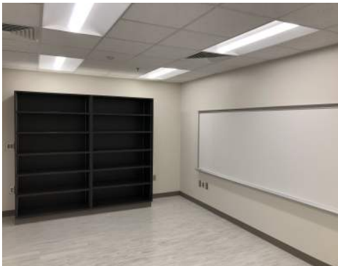
Installation of Markerboards in Fire & Emergency Services 233