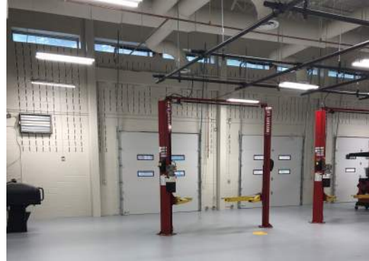
Installation of Auto Equipment in the Automotive Lab 166