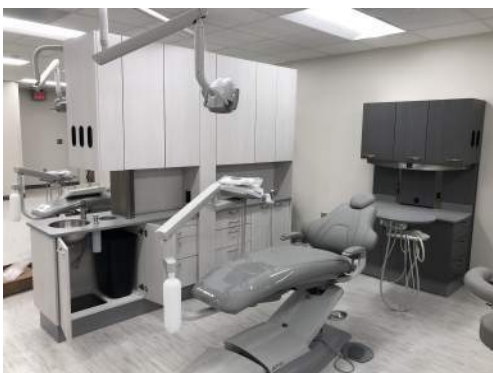
Installation of Dental Equipment in the Dental Lab 123