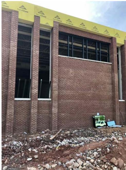
New gym window frames