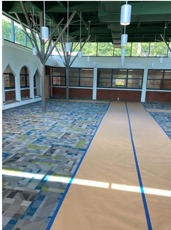
Media center carpet installation