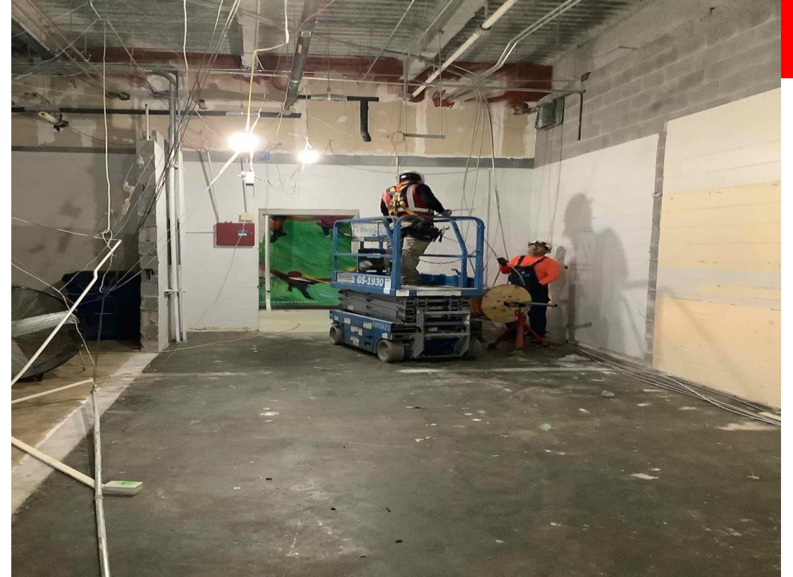
Electrical overhead installation