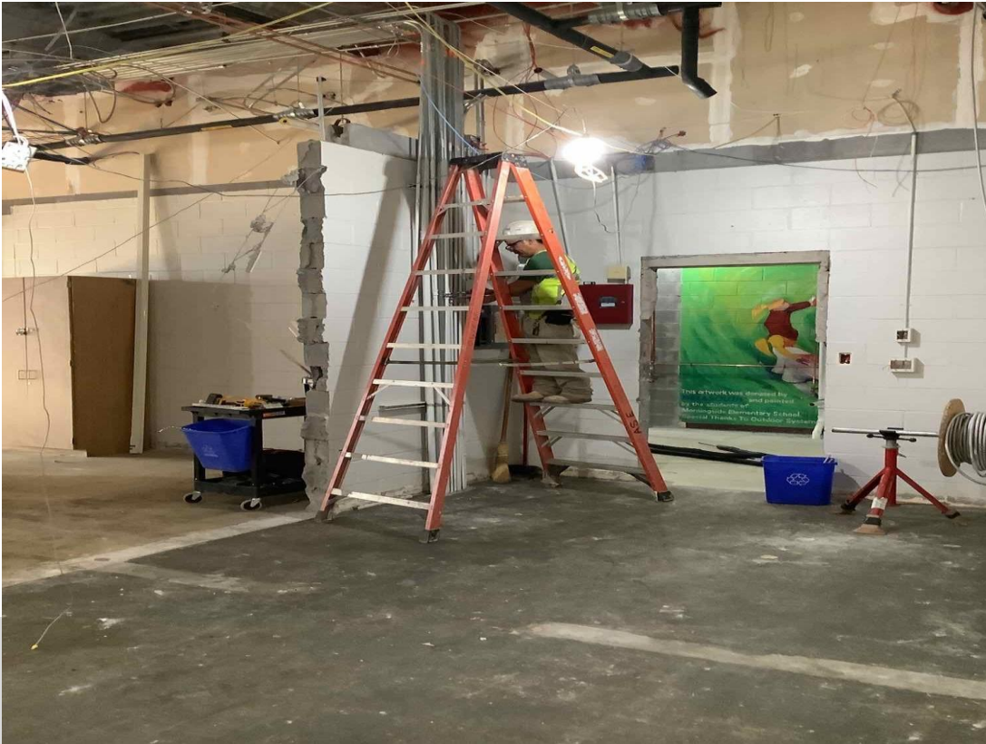
Electrical panel relocation