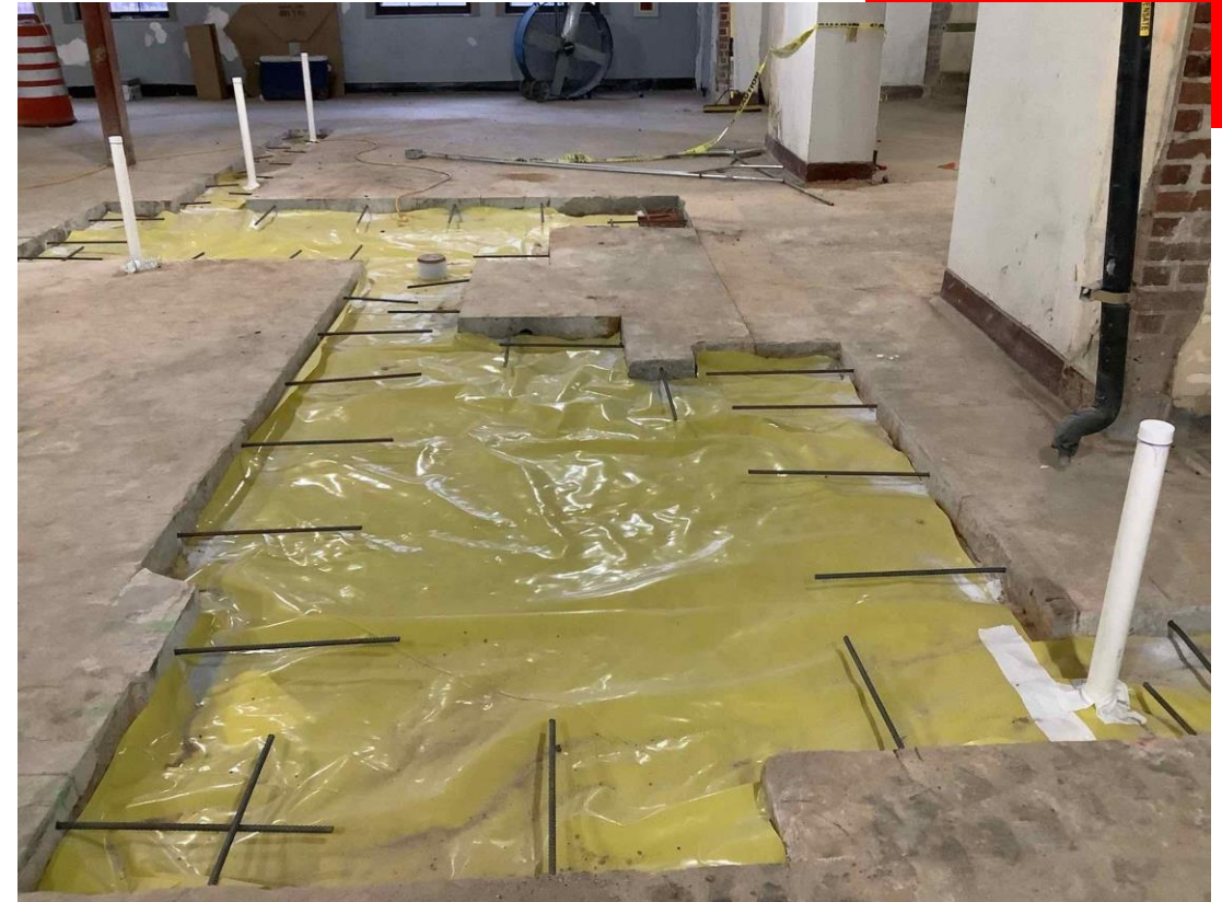
Vapor barrier and dowels at underground plumbing rough-in