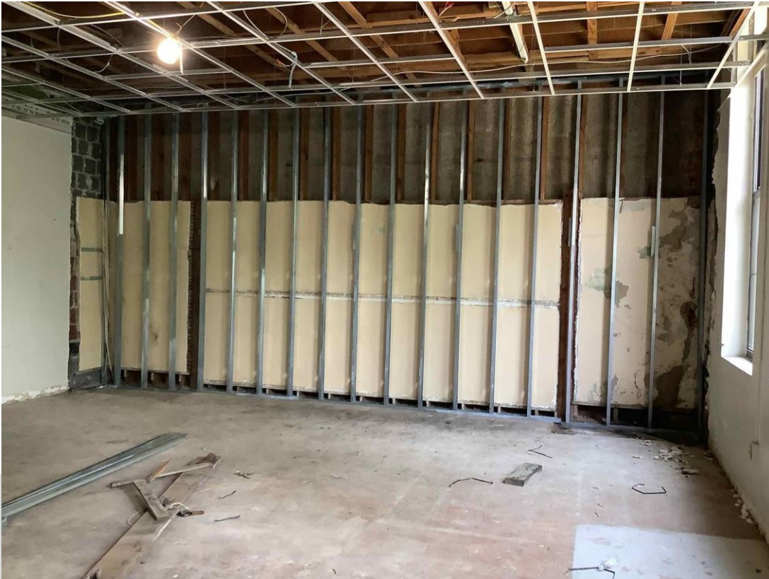
Interior wall framing