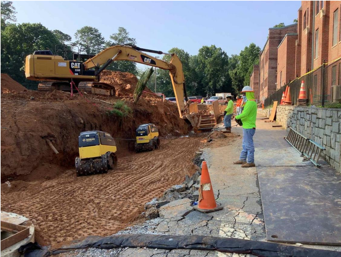
Site storm drainage installation