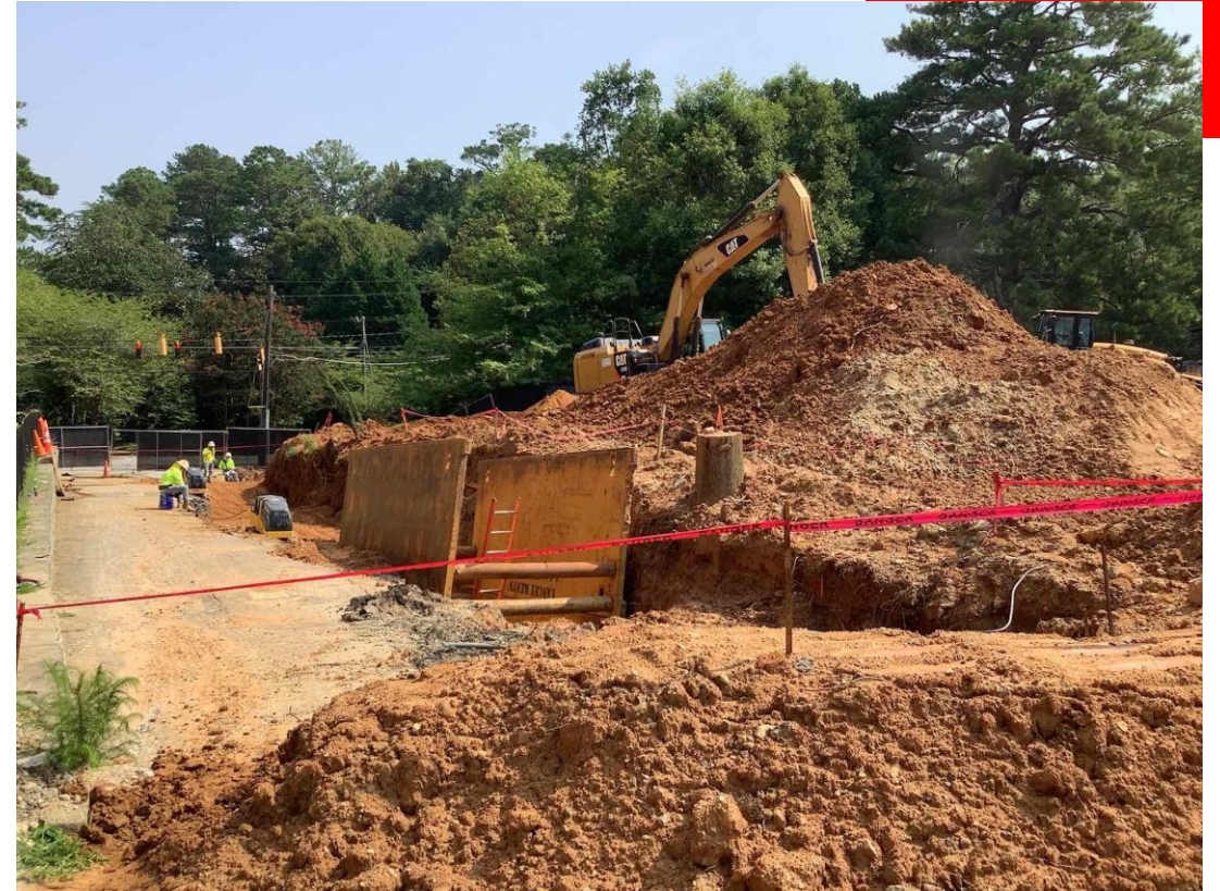
Site storm drainage installation