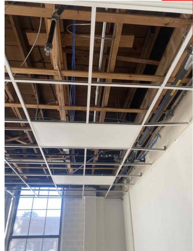
Interior lighting installation