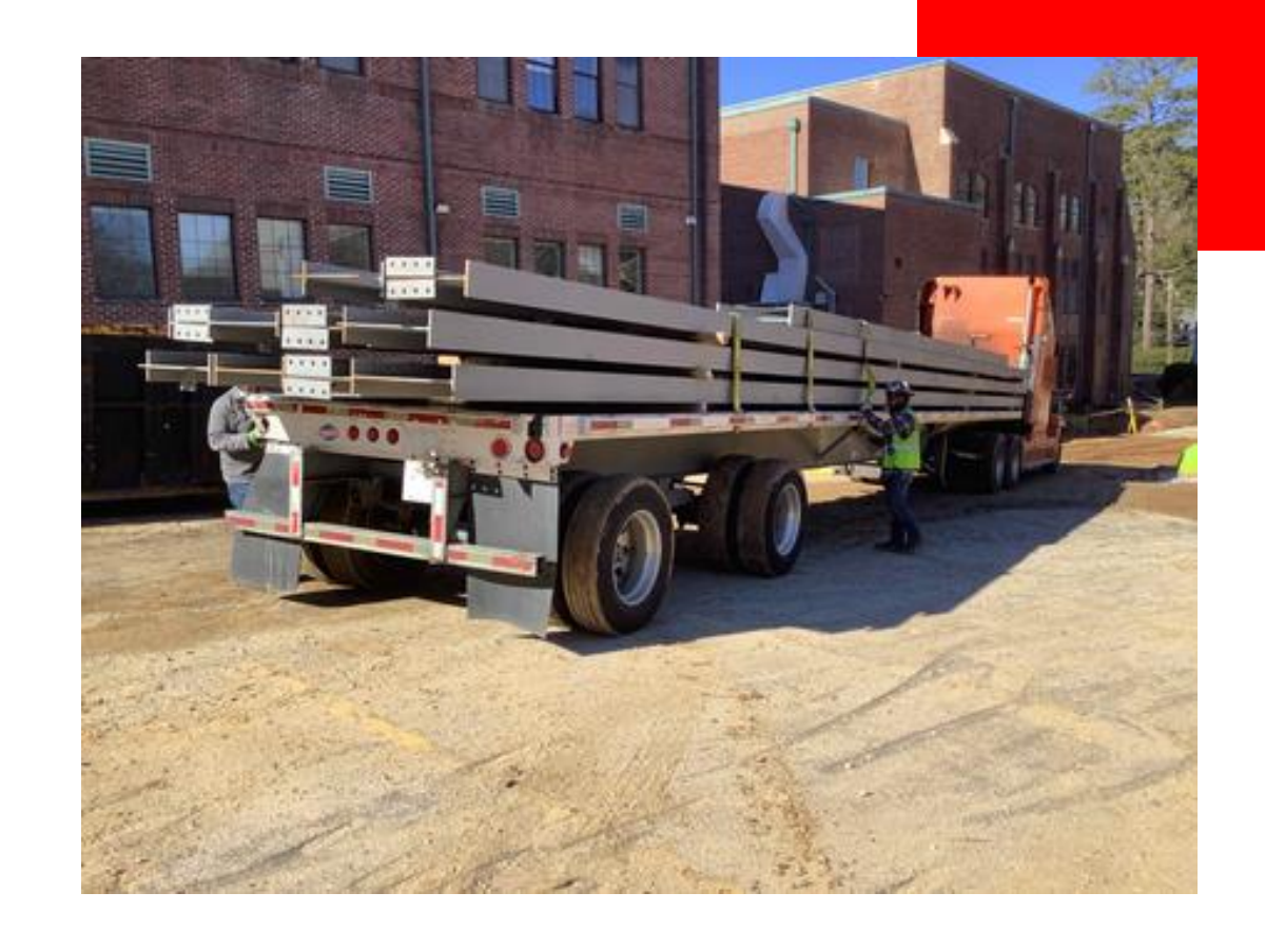
Structural steel delivery