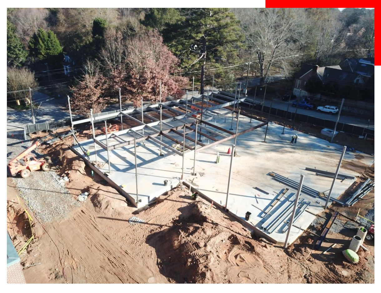
Structural steel installation