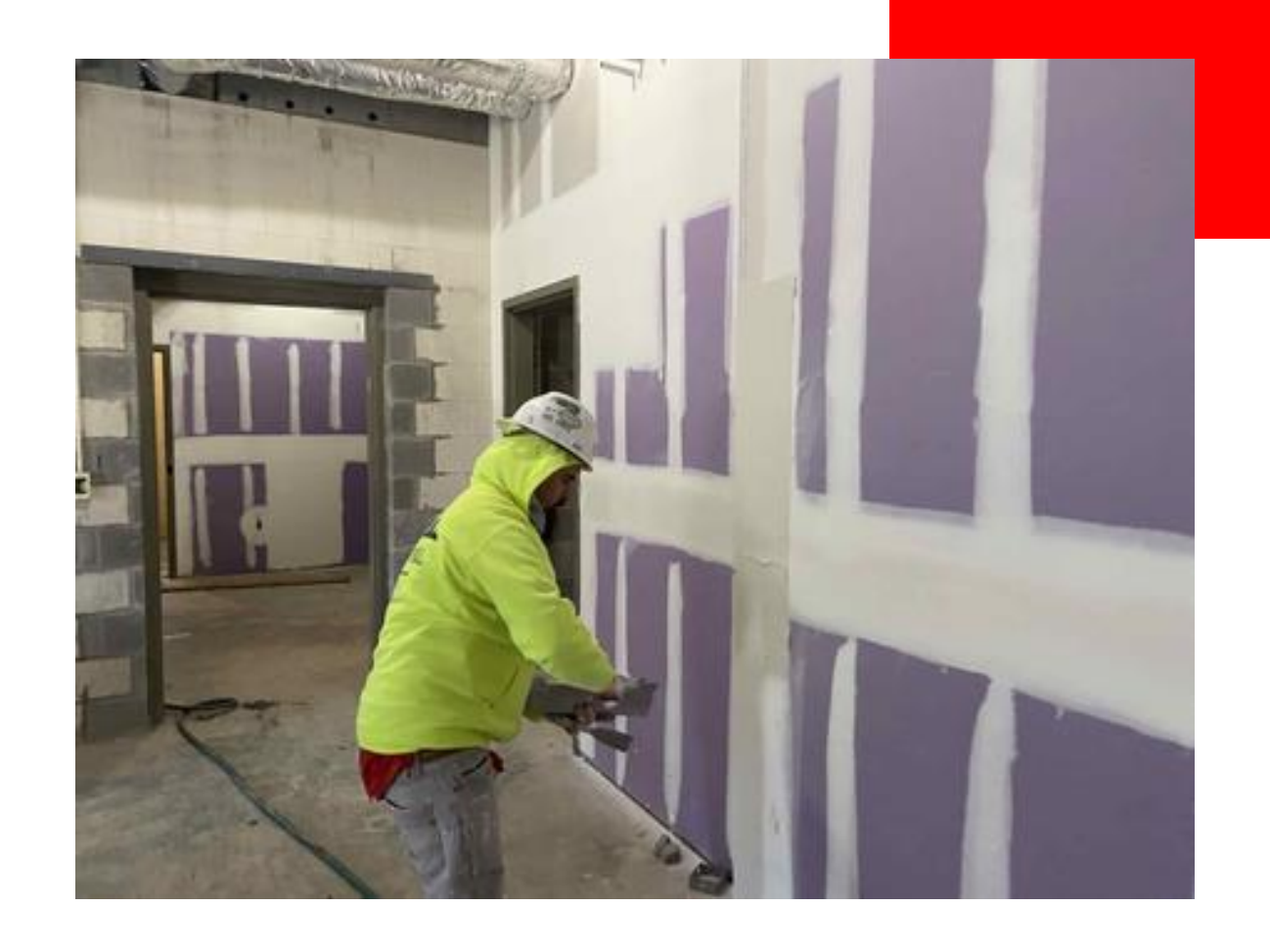
Drywall finishing continues