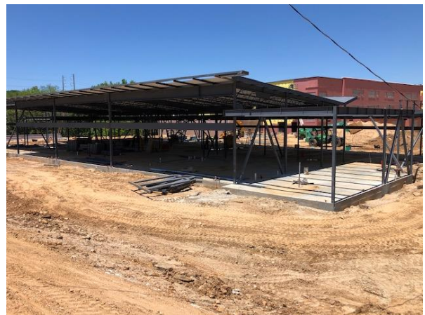
Roof decking at the YMCA