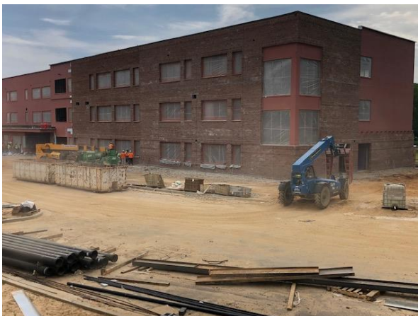
Brick on the NE side of WPA