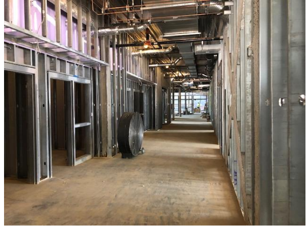
Interior framing at WPA