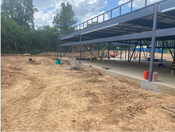
Exterior framing at YMCA started