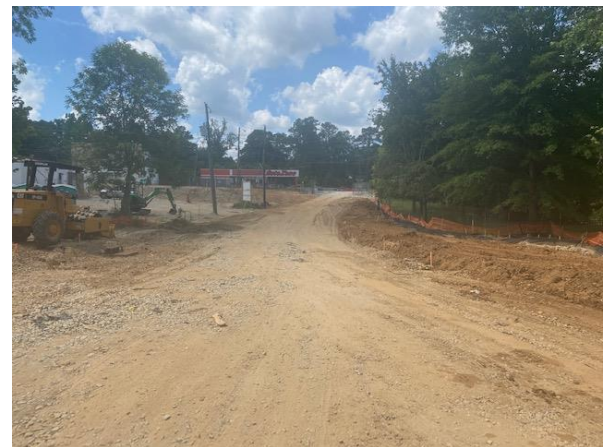
Bus loop ready for curb and gutter