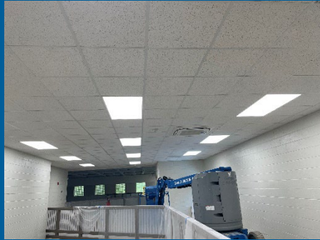
Ceiling Grid Install in Area A