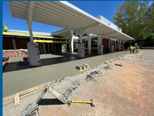
Vestibule and Canopy sidewalk concrete poured