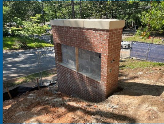
Monument Sign Cast Stone and Brick Installed