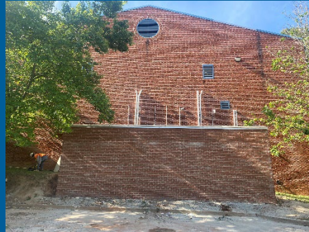
HVAC Units Masonry Screen wall Installed