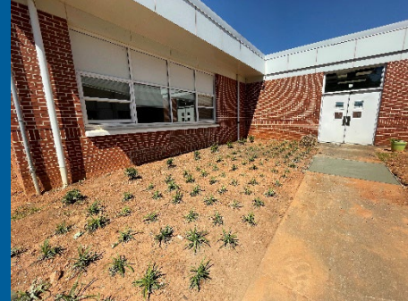
Onsite Planting Ongoing