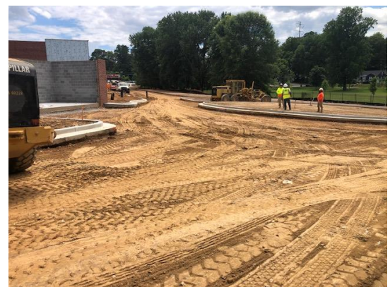
Grading at bus loop