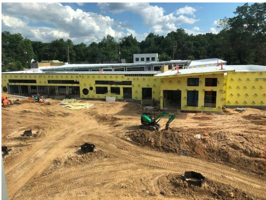
North elevation at YMCA