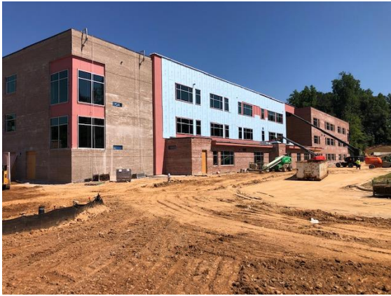
East elevation at WPA