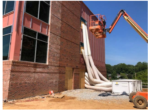
Temp AC at WPA