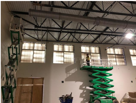
Gym glazing installed at WPA