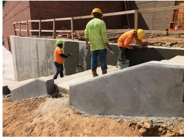
Site steps on South side of WPA