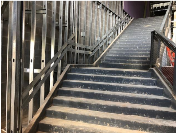
Monumental Stairs at WPA