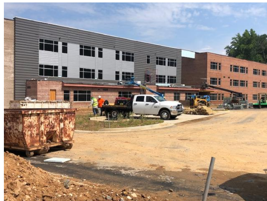
East Elevation at WPA