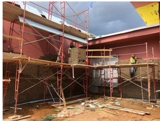
Brick at the YMCA