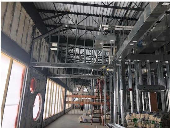
Framing at the YMCA