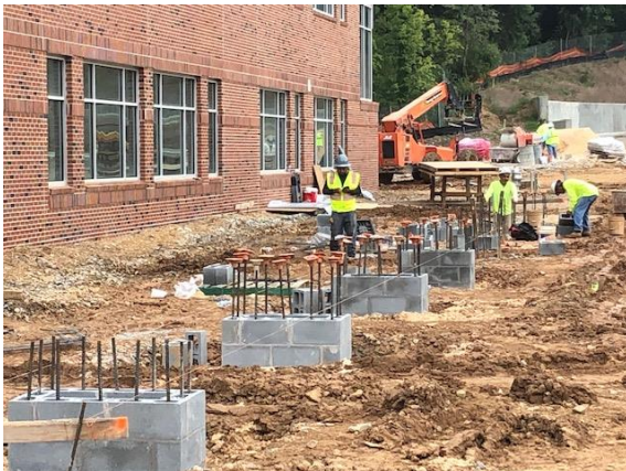
Canopy footers east elevation at WPA