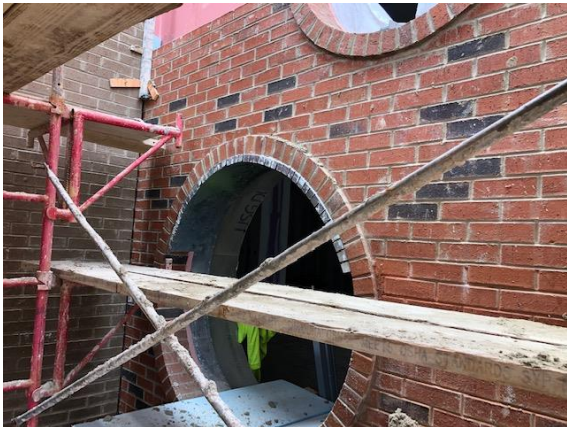
Roll-lock at round windows at the YMCA