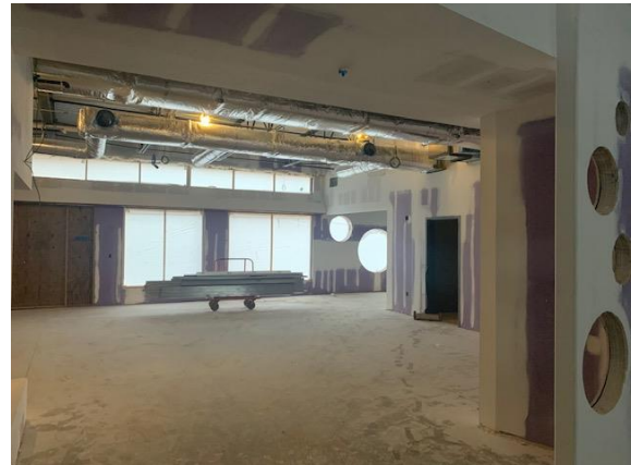
Typical Classroom at the YMCA