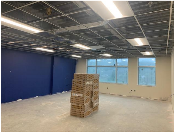
Typical Classroom at the WPA