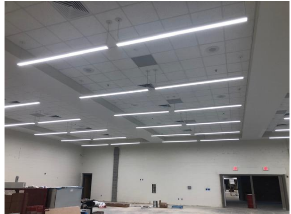
Cafeteria Ceiling and Lighting install at WPA