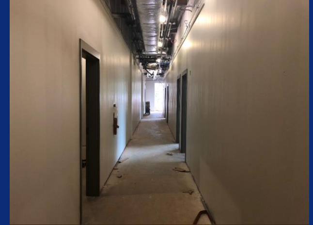
First coat of primer in corridor C6-2