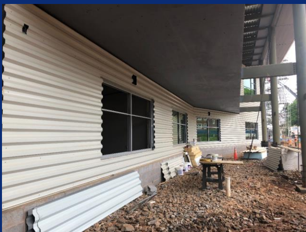
Metal Panel Install at North Entrance (Elevation F)