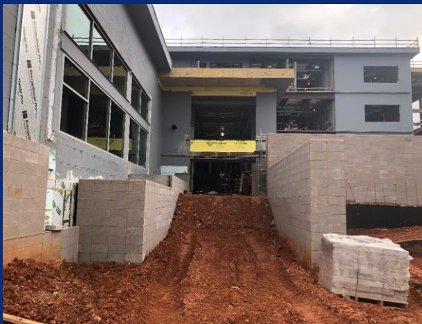
ACMU install at south entry stairs and planter wall