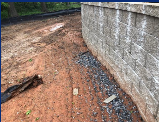
Mod block wall A installed at east end