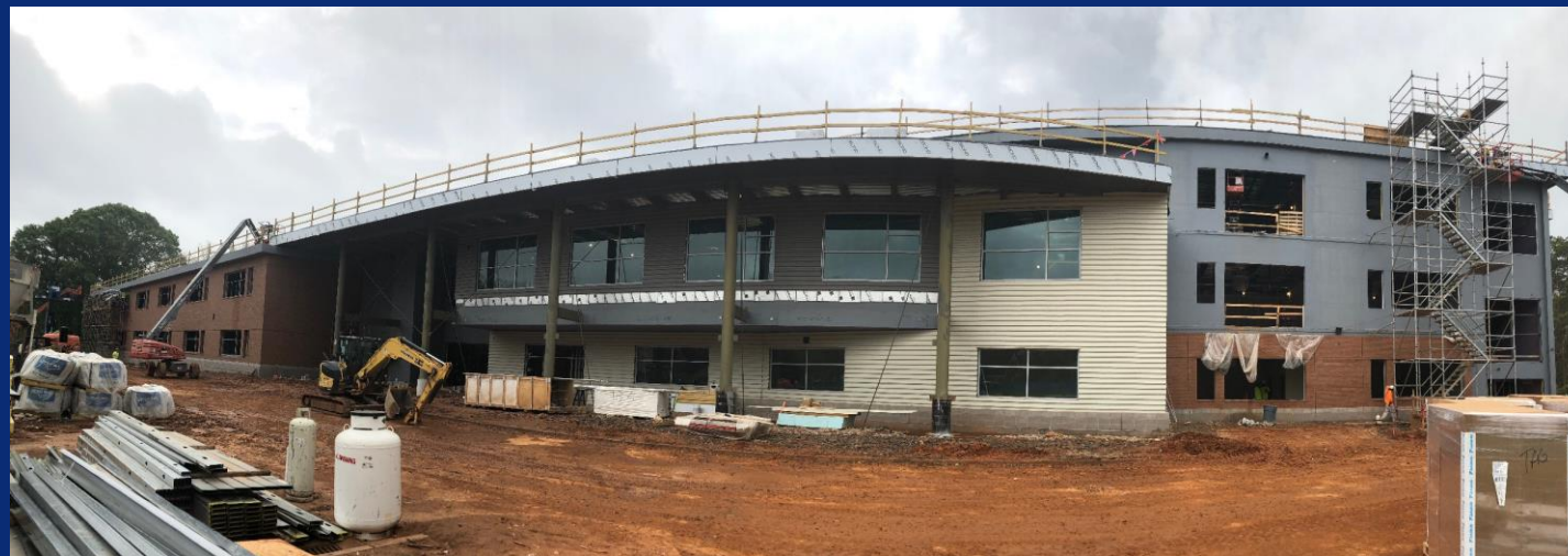
View of project looking south, from Westhaven