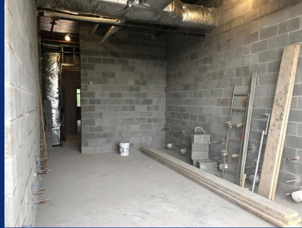
3 rd level gang restroom chase walls installed