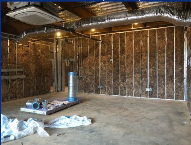
Insulation install in progress at main east