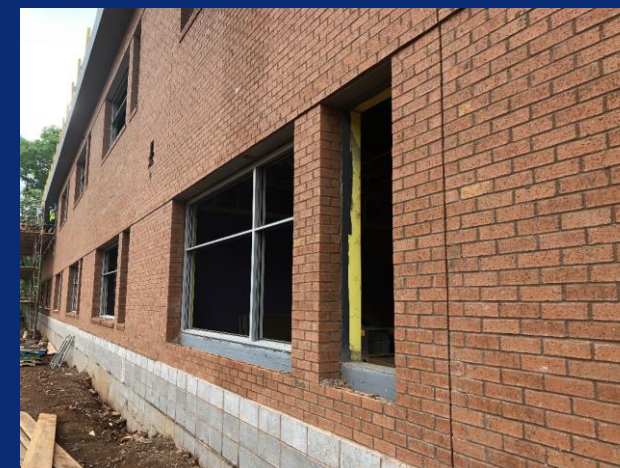
Brick installed on elevation G