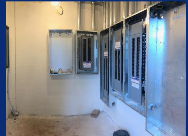
Panels installed in 2 nd level electrical room