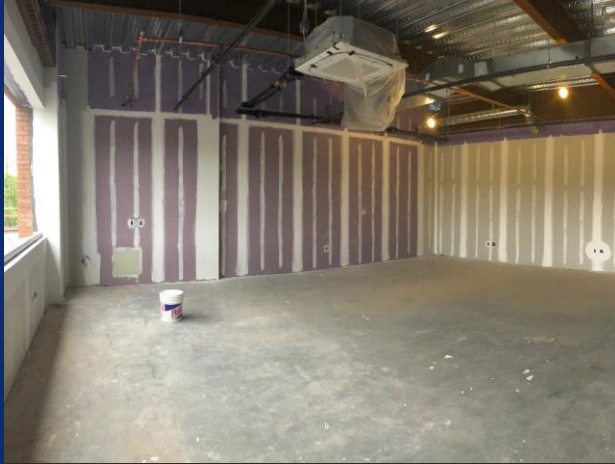
2 nd siding and finishing on second level west (rm 313)