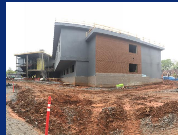
View from east end, looking west