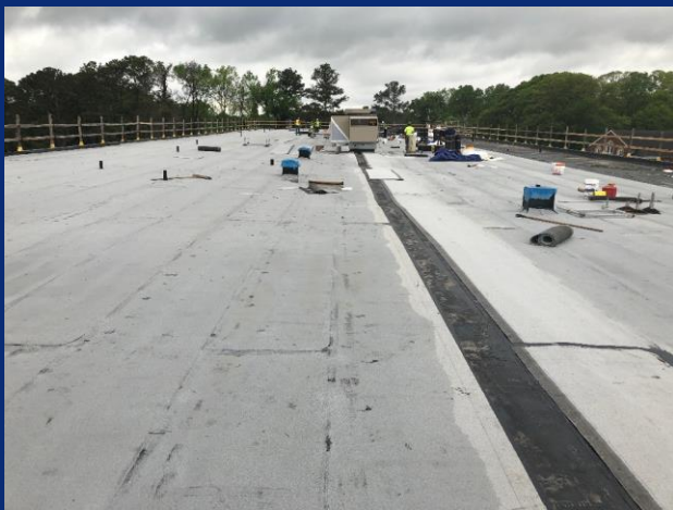
Whitecap roof in progress over 3 rd level