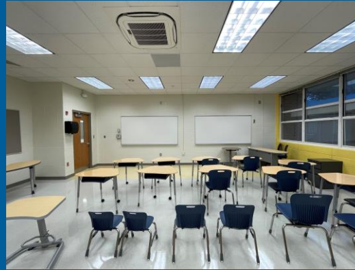
Final Clean of the Building