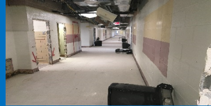
Demo of doors, frames, & display boards