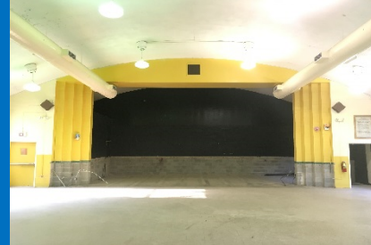
Demo of stage at Auditorium