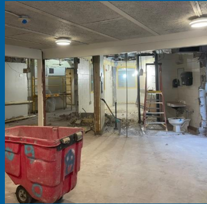
Demolition ongoing Electrical Safe-off ongoing