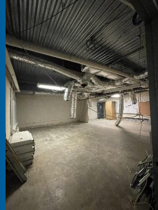
Demolition ongoing HVAC Demo ongoing