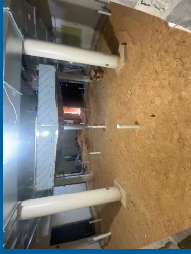
Backfill Kitchen Area