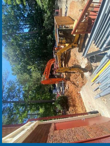
Grease Trap Install