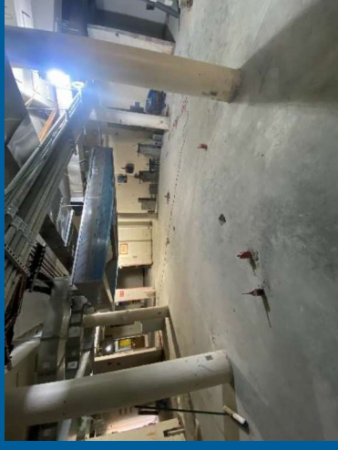
Kitchen Concrete Slab