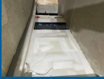
HVAC Units Set Drywall Patching