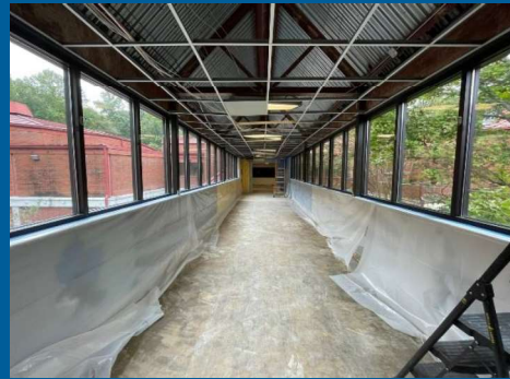
Demolition ongoing Door Protection In Place