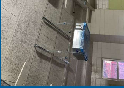
HVAC Rough-in Ongoing Demo Complete