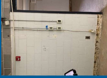
Electrical Rough-in Ongoing Demo at Kitchen