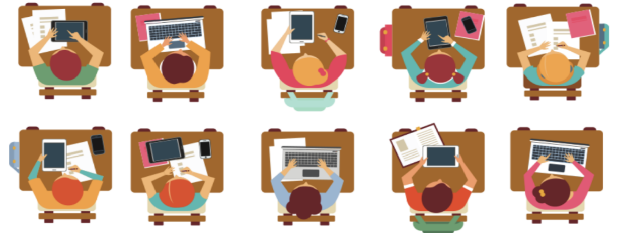
In the classroom