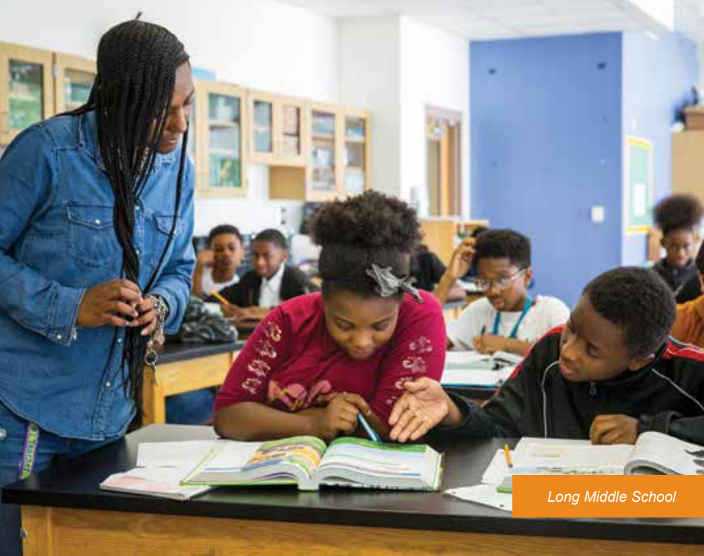
Long Middle School

Through a caring culture of equity, trust, and collaboration, every student will graduate ready for college, career, and life.