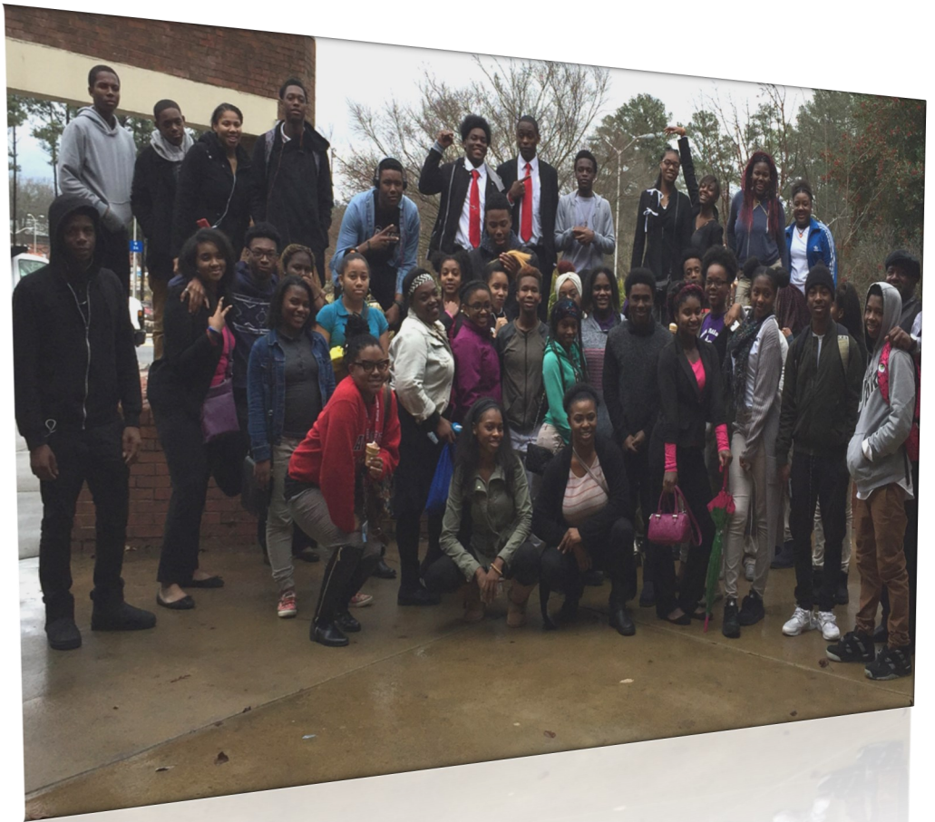
Students at University of West Georgia on a campus tour February 24th!

Keep up with these steps throughout your high school career. Be AHEAD of the GAME.